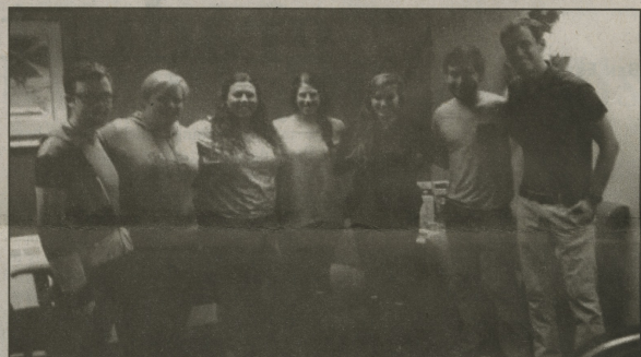
Students and faculty engage with one another at the Dine and Diversity event.